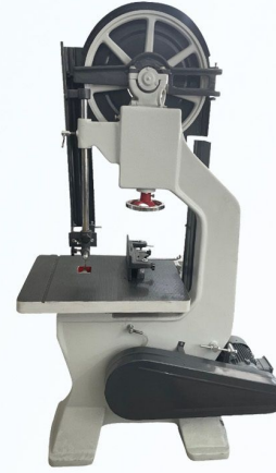
ARKA GÖRÜNÜM REAR VIEW