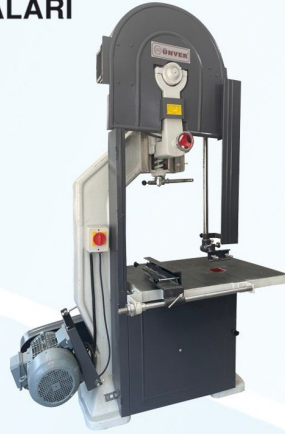
KLASİK ŞALTERLİ CLASSICAL SWITCH