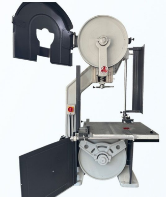
DOLU KASNAK COMPLETE PULLEY