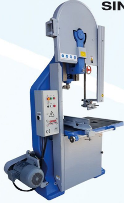
CE ELEKTRİK PANOLU CE ELECTRICAL BOARD